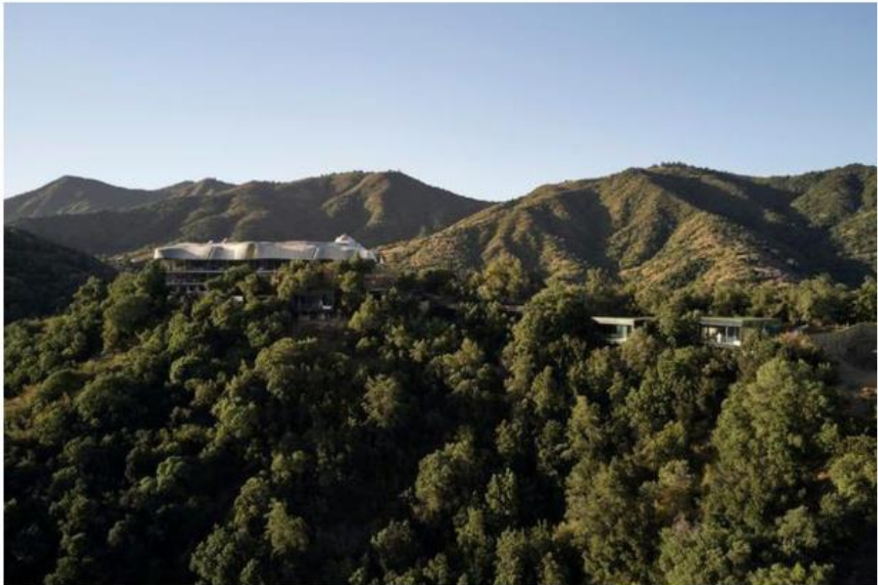
The property at Puro Vik nestled into the mountainside.

The area a few hours drive south Santiago is dotted with wineries, making it a good stop for any oenophile. “Chile has always had a lot of great wineries producing fantastic wines, but few had any real places to stay,” Mikkelson said.